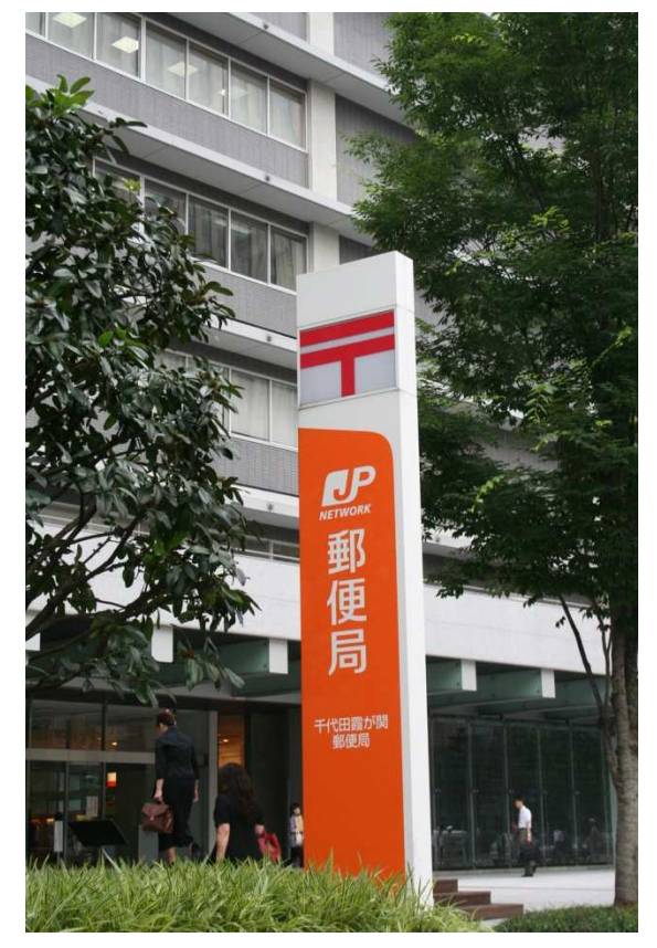
Post Office The Japan Post Group came into being following privatization in 2007.

With the expiration of the time period covered by the 1995 plan, in 1998 the government established the Three-Year Program for Promoting Deregulation, which included new measures as well as not-yet-implemented measures from the previous plan. The goals of this three-year plan were to carry out a drastic structural reform of Japan's