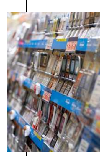
Mobile telephones Affordable rates and a wide variety of services have spurred sales of mobile telephones.

In April 2001 the Council for Regulatory Reform was established as part of the Cabinet Office to act as an advisory body of the prime minister over a three-year term. The first two reports prepared by the council served as the basis for revisions made to the three-year program in 2002 and 2003. The 2002 revised program focused on the six areas of medical care, social welfare and childcare, employment, education, the environment, and urban redevelopment; and the 2003 revised program incorporated a new emphasis on facilitating the creation and optimal utilization of special zones for structural reform. The council's final report, issued in December 2003, summarized the results of past reform efforts and set forth issues to be tackled in the future. From 2004, the discussion of regulatory reform within the government was handled by the Council for the Promotion of Regulatory Reform (2004-2007) and the new Council for the Promotion of Regulatory Reform (2007-2010); and since March 2010 that regulatory and systematic reform is being handled by the committee set up by the Government Revitalization Unit.